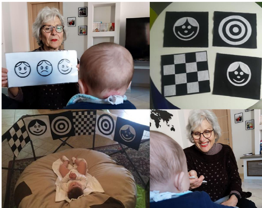
Figure 1: Engagement, fixation and tracking exercises.

7. Red Reflex. The red reflex is the appearance of a red coloration across the entire pupillary field when the